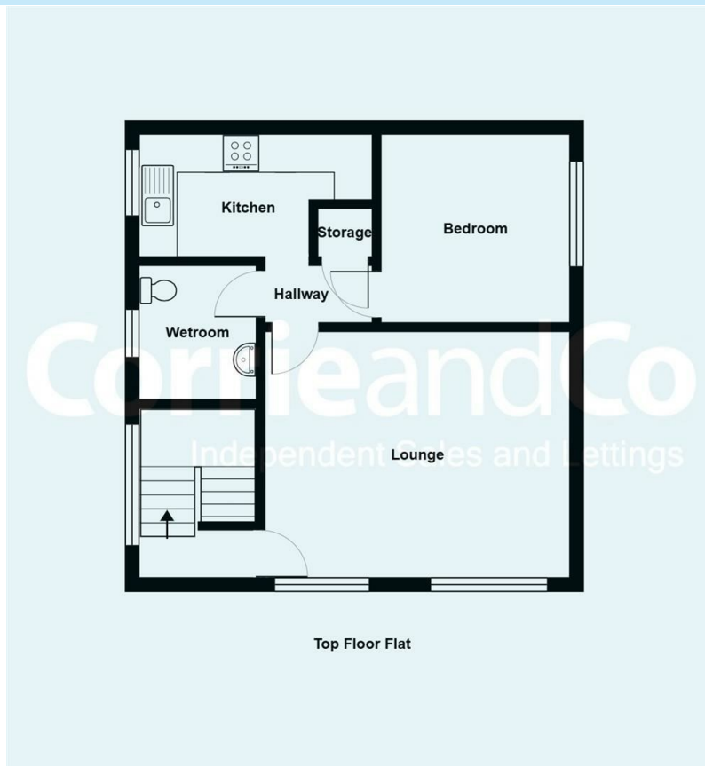
Top Floor Flat

We are local, family run business who are wholly independent which means we can recommend services to most suit your needs. Our aim is to provide quality advice and expertise at all times, so you can make an informed decision whether buying or selling.